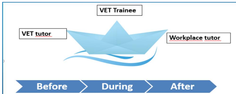
Image 3. WBL process

Training is implemented as a simulation of WBL process Before-During-After looking from the perspective of 3 main actors: VET tutor, Trainee, Workplace Tutor (See Image 3 ).